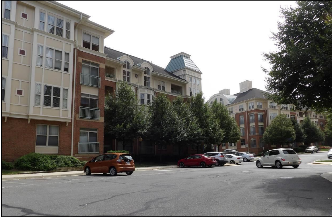
Photo 2: Wiehle/Sunset Hills Historic District (029-0014), Stratford House Drive, Looking Southwest.