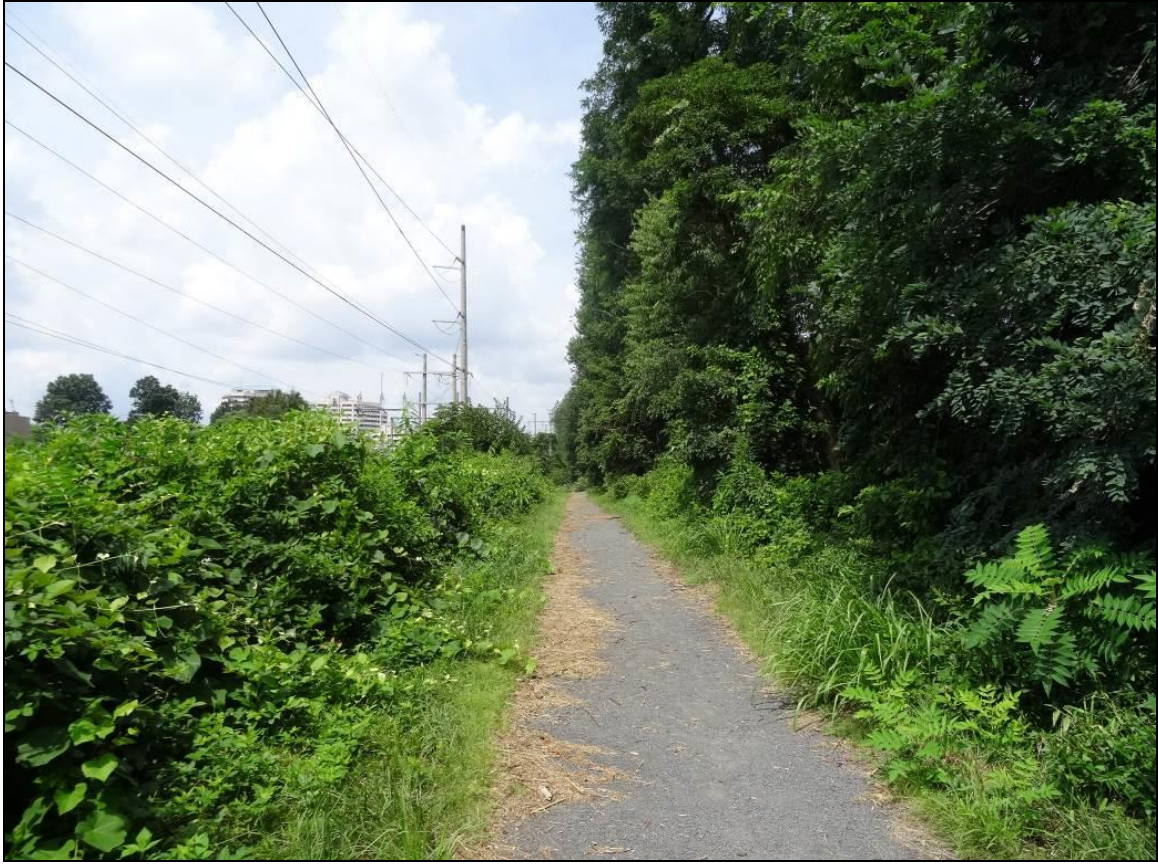
Photo 1: Washington & Old Dominion Railroad Historic District (053-0276), Looking West Towards American Dream Way.