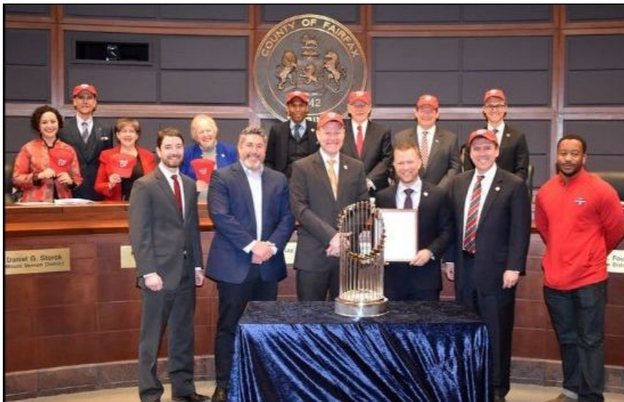
The Board of Supervisors recognized the Washington Nationals for winning the 2019 World Series.