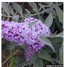
Butterfly Bush ( Buddleia davidii )