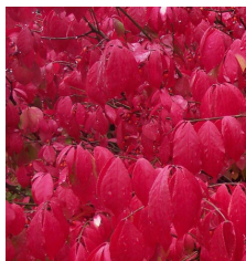
Burning Bush ( Euonymus alatus )