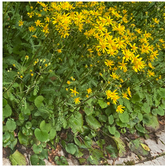
Golden Groundsel ( Packera aurea ) makes a great ground cover. The attractive foliage is semi-evergreen and the showy flowers provide an early source of pollen for bees.

Native plants support wildlife in the form of food and shelter. Birds, bees, butterflies, and other insects all depend on native plants for survival. Some even specialize on specific plants. Having native plants on your property will help increase the diversity of wildlife you support and see.