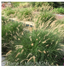
Fountain Grass ( Pennisetum alopecuroides )