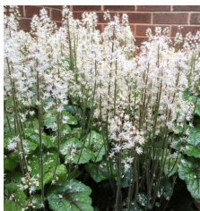
Foamflower ( Tiarella cordifolia )