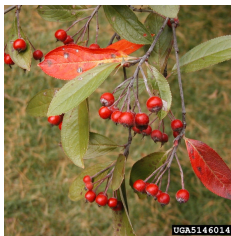
Red Chokeberry ( Aronia arbutifolia )

These native plants provide growth habit and color similar to the invasive species, while also benefitting local wildlife.