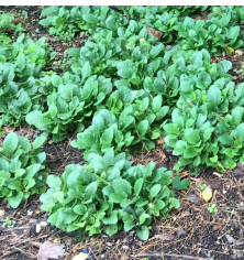
Green and Gold ( Chrysogonum virginianum )