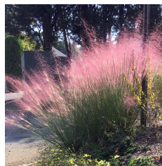
Muhly Grass ( Muhlenbergia capillaris )