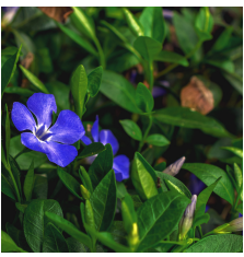
Common Periwinkle ( Vinca minor )