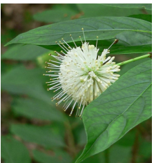
Buttonbush ( Cephalanthus occidentalis )