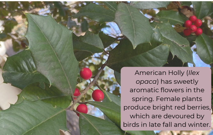
American Holly ( Ilex opaca ) has sweetly aromatic flowers in the spring. Female plants produce bright red berries, which are devoured by birds in late fall and winter.

Native plants help our landscapes come alive and enrich our lives. We have a diverse heritage of flora and fauna in Northern Virginia, and we benefit from knowing and celebrating the special plants in our area.