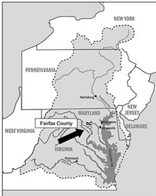
Figure 1.2 The Chesapeake Bay watershed

Streams and rivers may flow through many different types of land use in their paths to the ocean. In the above illustration from the U.S. Environmental Protection Agency, water flows from agricultural lands to residential areas to industrial zones as it moves downstream. Each land use presents unique impacts and challenges on water quality.