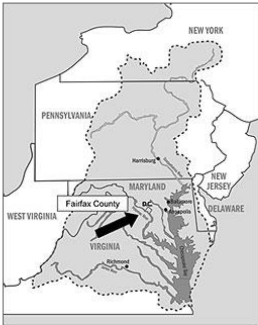
Figure 1-2: The Chesapeake Bay watershed

Streams and rivers may flow through many different types of land use in their paths to the ocean. In the above illustration from the U.S. Environmental Protection Agency, water flows from agricultural lands to residential areas to industrial zones as it moves downstream. Each land use presents unique impacts and challenges on water quality.