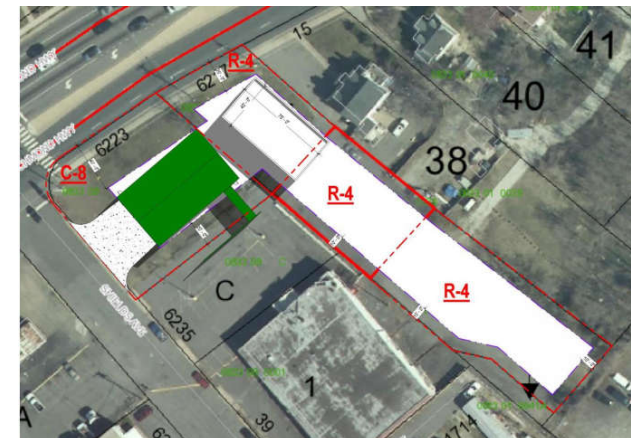
6223 & 6217 Richmond Hwy sites