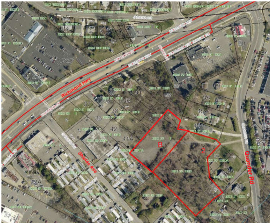
6234 Quander Road site