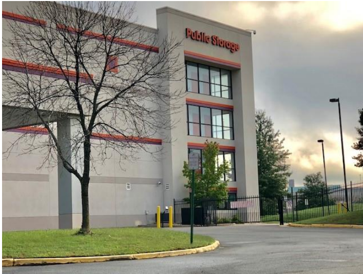
Self-Storage on Waples Mill Road