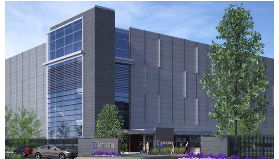
Coresite Realty Reston Data Center