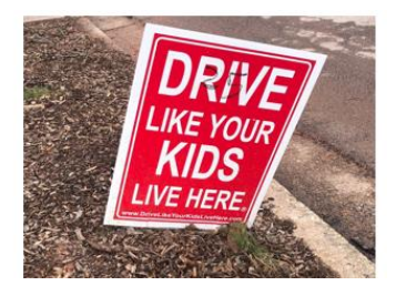
Figure 2: Examples of Yard Signs

Signs During Active Construction or Alteration: One sign (limited to four square feet and no more than four feet in height) is permitted for an individual single-family dwelling unit undergoing construction, improvement, or renovation. The sign cannot be displayed prior to commencement of the improvement or renovation work and must be removed within seven days of completion of the work, or within six months (whichever is less). This regulation was the subject of the most complaints received since the new regulations went into effect. In an effort to educate the building community on these limitations, staff has issued an <u>interpretation</u> (Attachment 2) highlighting and clarifying these regulations. In addition, outreach on these regulations is being conducted with the Northern Virginia Building Industry Association (NVBIA) and NAIOP, the Commercial Real Estate Development Association, as well as the Custom Builders Council.