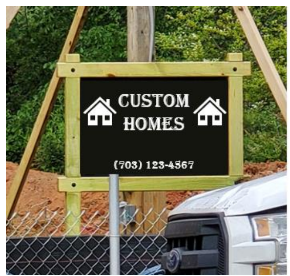
Figure 3: Example of a Sign During Active Construction or Alteration

Staff Recommendation: Staff recommends codifying the interpretation in the future Phase II amendment to the Sign Ordinance by clarifying what constitutes the commencement of construction for this purpose.