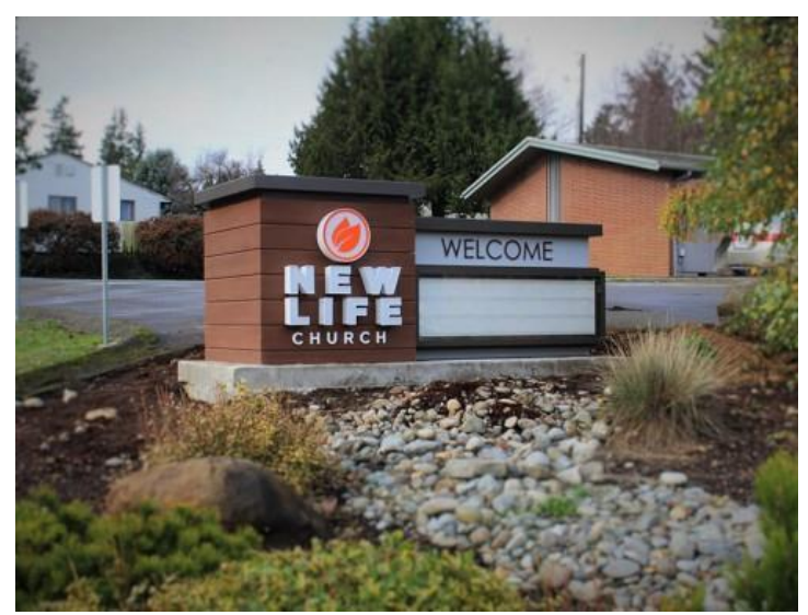
Figure 4:Example of a Freestanding Sign

Staff Recommendation: As previously discussed, complaints have been received related to the presence of too many signs and on the size of signs for nonresidential development in residential zoning districts, and staff has received comments recommending that the maximum sign area be tied to lot size. However, staff does not recommend any changes at this time, but will continue to monitor these complaints and will have these be a focus area during upcoming outreach and education efforts. As with residential dwellings, an amendment limiting the overall maximum signage for nonresidential uses in residential districts, inclusive of minor signs and freestanding signs, could be considered to further limit the cumulative impact of signs in residential districts.