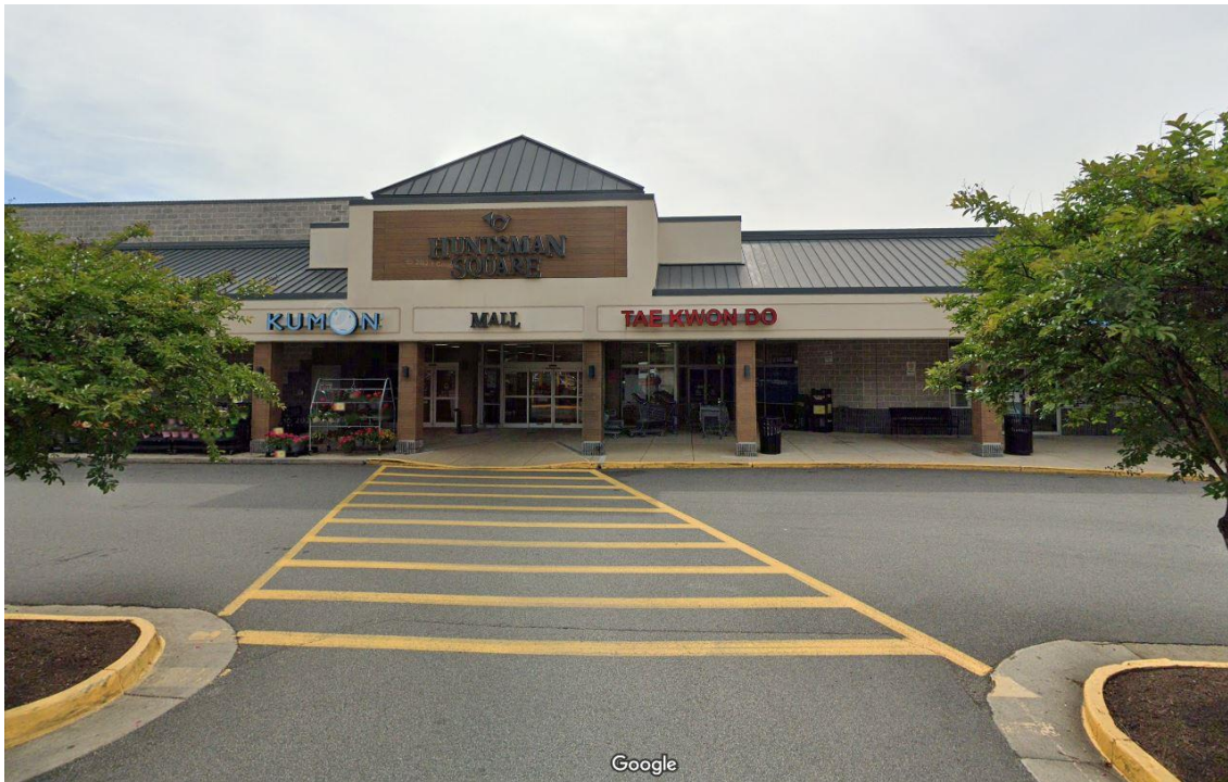
BSCAA Mall Entry/Front Parking Lot