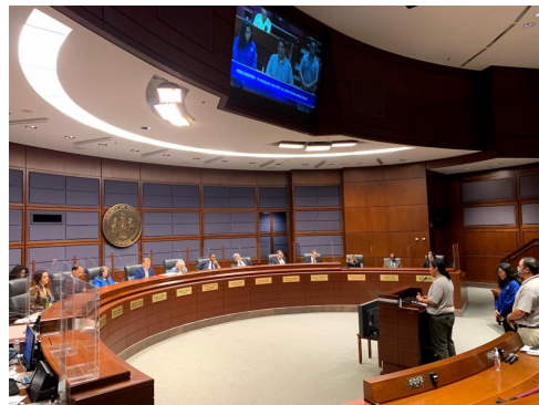
July 2021 as Latinx Conservation Month

To view the June 22, 2021 Board Package click here .