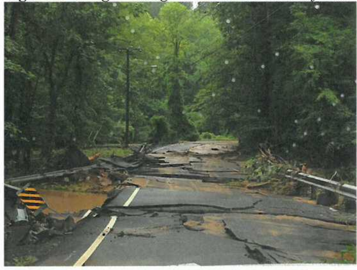
Figure 1. Bridge Damage at Swinks Mill Road from the July 8, 2019, storm (VDOT)

Note. Reprinted from VDOT News Release. <a href="https://www.virginiadot.org/newsroom/northern-virginia/2019/update-road-repairs-in-mclean-continue-following-floods7-25-2019.asp">https://www.virginiadot.org/newsroom/northern-virginia/2019/update-road-repairs-in-mclean-continue-following-floods7-25-2019.asp</a>.