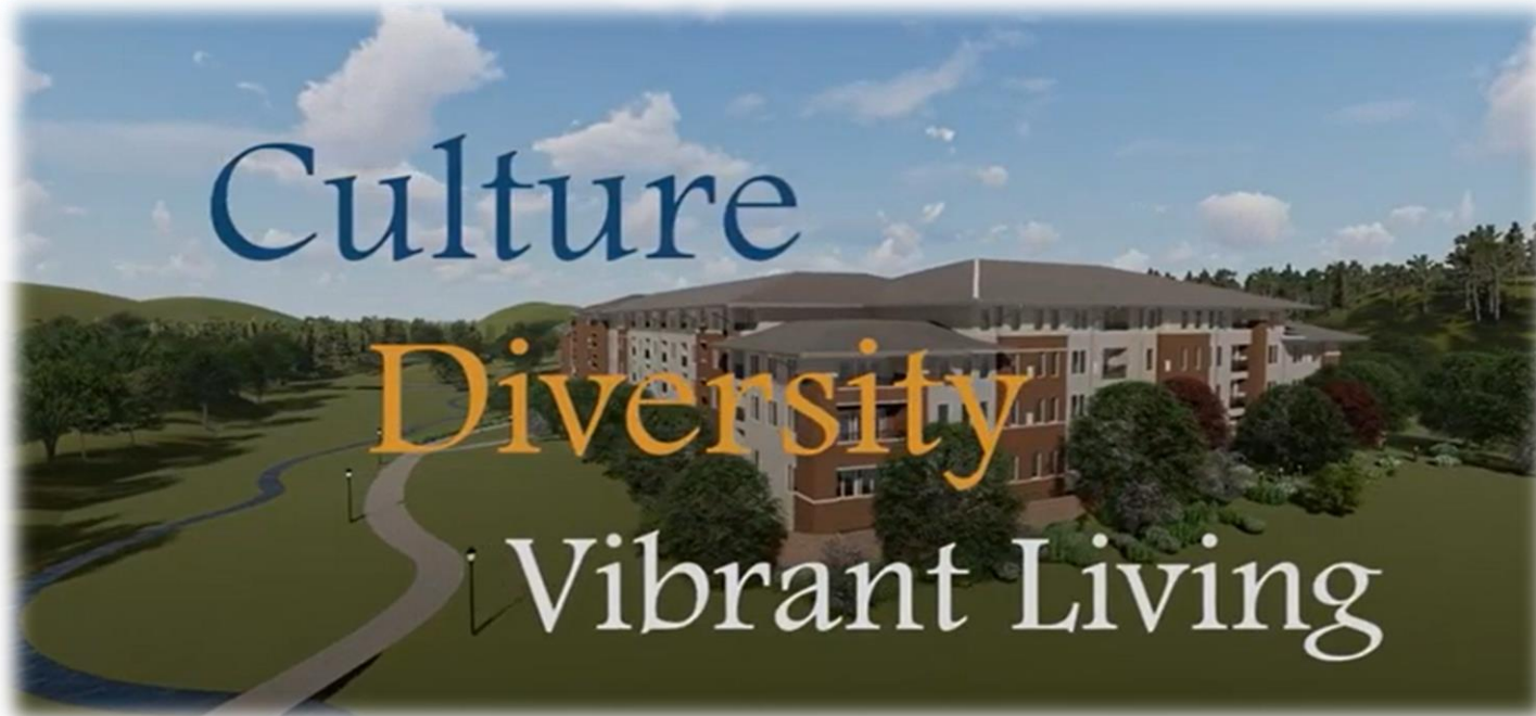
Hunters Woods at Trails Edge

“We brought attention to that need. ‘50+’ resonates now. It’s accepted wisdom.”